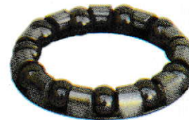
Ball Retainer (11 Balls) C-503362