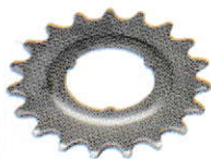
Sprocket (16T, 18T, 19T, 20T & 22T) "Snap-On" or "Threaded"