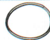
Sprocket Securing Circlip C-502621