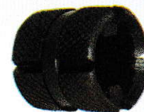
Steel Brake Drum C-502593