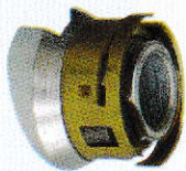
Brake Actuator C-502681