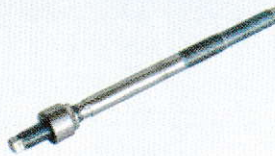
HUB AXLE C-5063