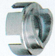
Roller Guide Ring C-502682