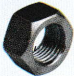
NUT A/F 14 mm. C-502673