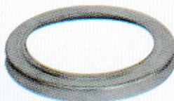
Sprocket Dust Cap C-503370