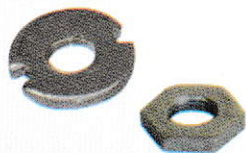
Lock Nut (Round/Hexagonal) (A) C-5060 (B) C-50604