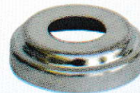
Arm Cone Dust Cap C-503364