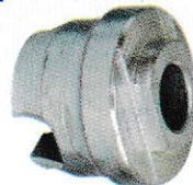
ARM CONE C-503365